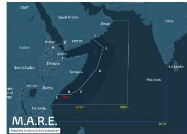
Figure 1 – Historical changes in HRA boundaries