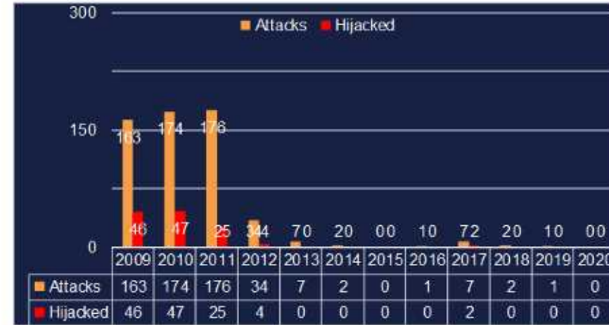
Figure 2 – Attacks and Hijacked vessels from 2009 to 2020